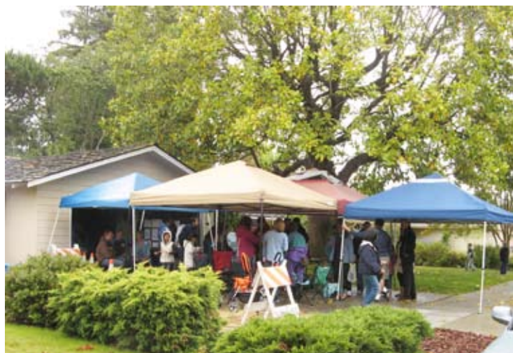
"Pop-up City" aka Cherryhill Neighborhood's Block Party 2011