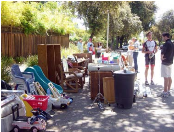
Some of the many "freecycle" treasures found on Cranberry Drive

A huge thank you to everyone who participated in our first annual Freecycle/Dumpster Day on May 21st! The city of Sunnyvale hauled away FOUR dumpsters worth of trash. Countless treasures changed hands on Cranberry and Maraschino Drives (remaining items were donated to Goodwill and the Salvation Army). The Maraschino Drive bake sale, organized by Tasha Mendelsohn, earned $172 for the Red Cross. Great work, everyone!