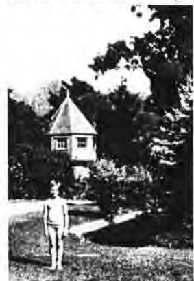
At left, 1933 photo shows the fish pond and the gazebo that topped the shaft mentioned in stop 3. At right, "Diana's Temple" over inlet to tunnel No. 2 is reflected in lake.

Above, Superintendent George Logan sits on Slate House steps. The residence was built in 1904. Stop 5.